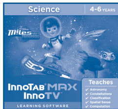
Miles from Tomorrowland